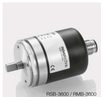
RSB-3600 / RMB-3600